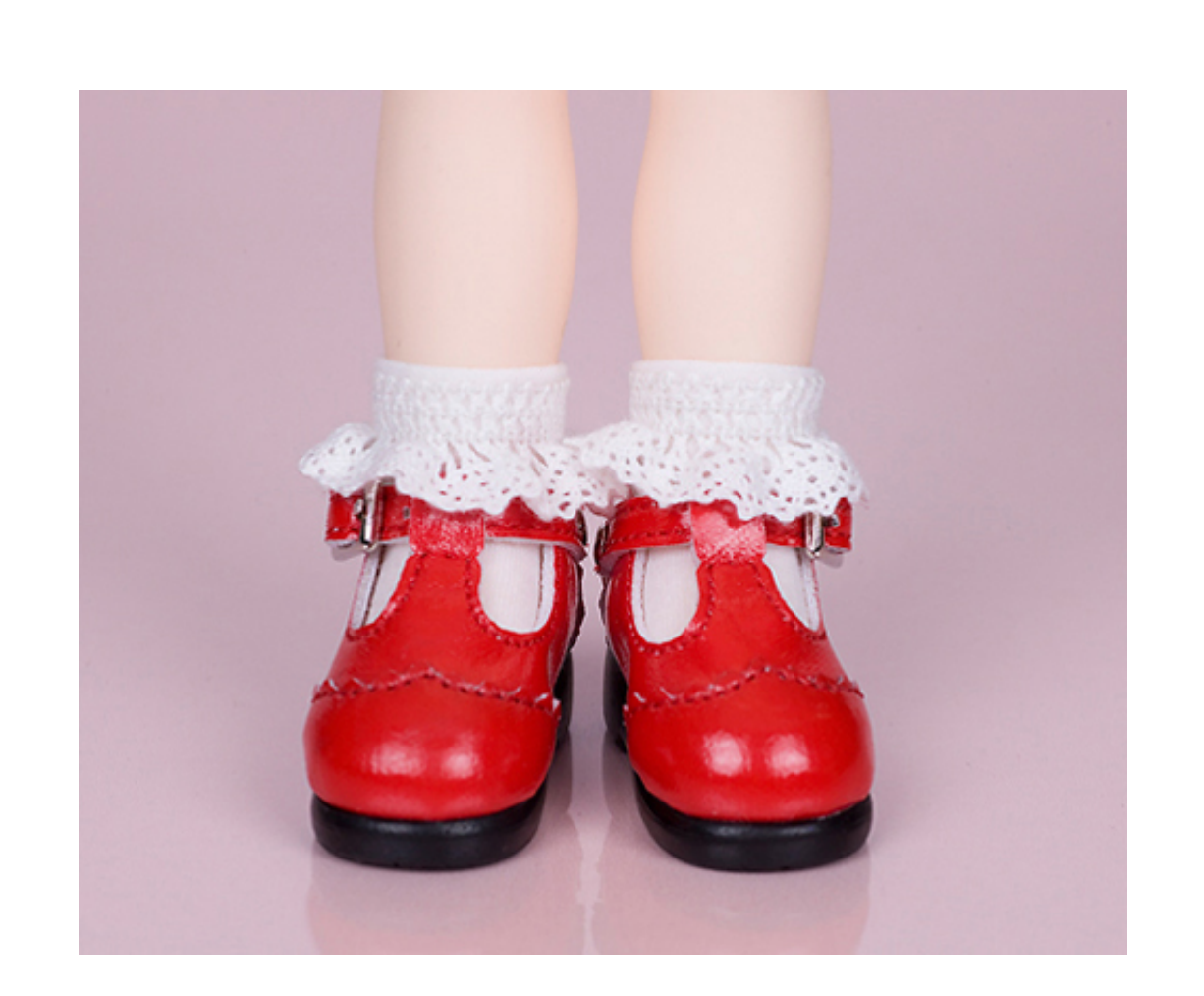
LS Models LS Land Issue 04 Fairyland Rar 142